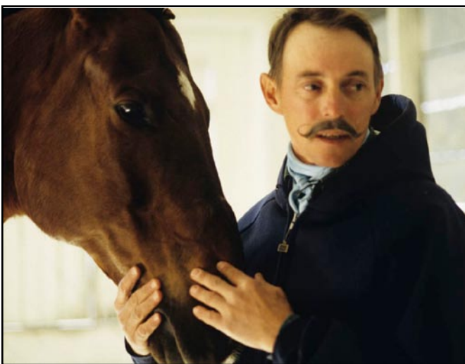
Hightower on the set of "The Horse Whisperer" (1998)

“He was a great horse. If you only have one great horse in your lifetime, you can consider yourself very lucky.”