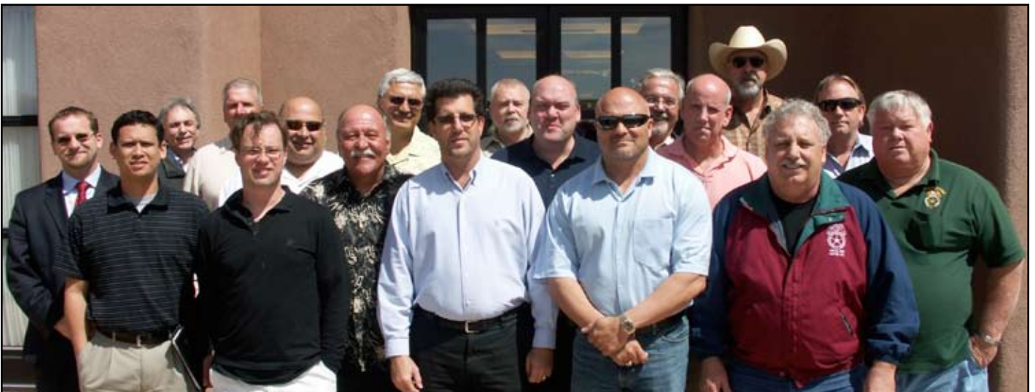
Representatives meet in New Mexico