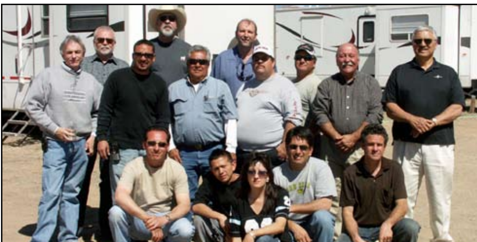
Shooting in New Mexico