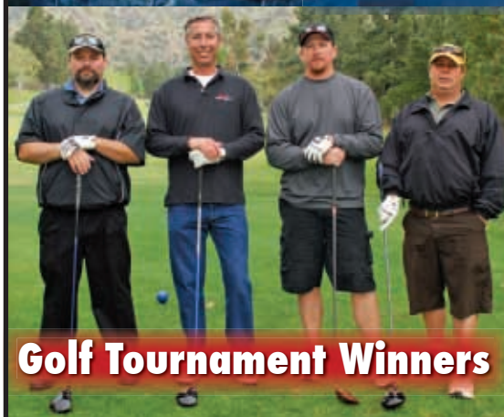
Golf Tournament Winners