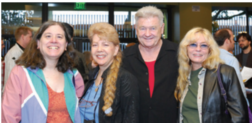
Attendees at composers' meeting