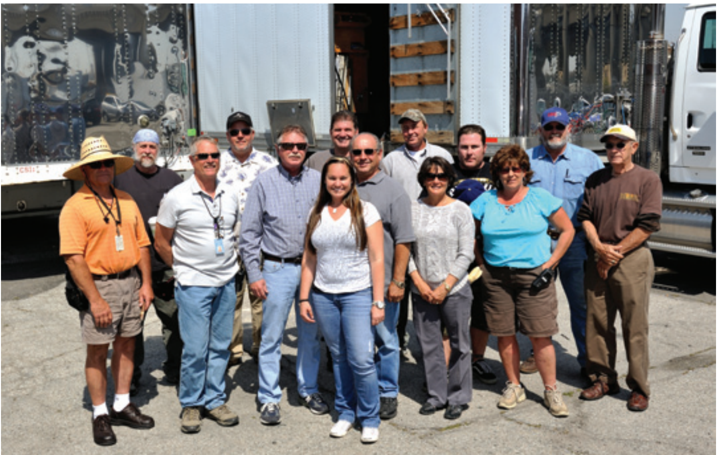
The Teamster crew of CSI Las Vegas

to life after Hollywood. “I feel great and I’ve saved enough energy to really enjoy my retirement,” he added with a chuckle. “It’s been a great ride, but it’s time to go.”