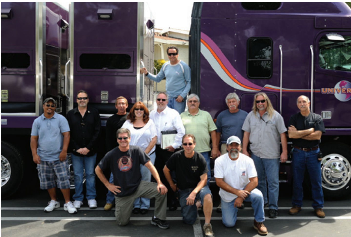
The Teamster crew of Bloodline