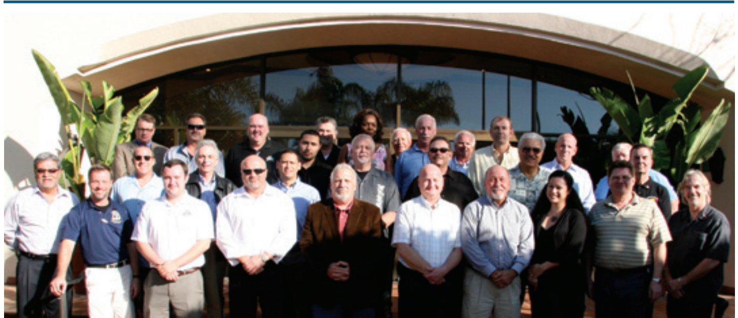
At a Motion Picture Division meeting in December 2011 representatives from throughout the nation voiced their unity and support for Local 399 in contract negotiations. PAGE 6