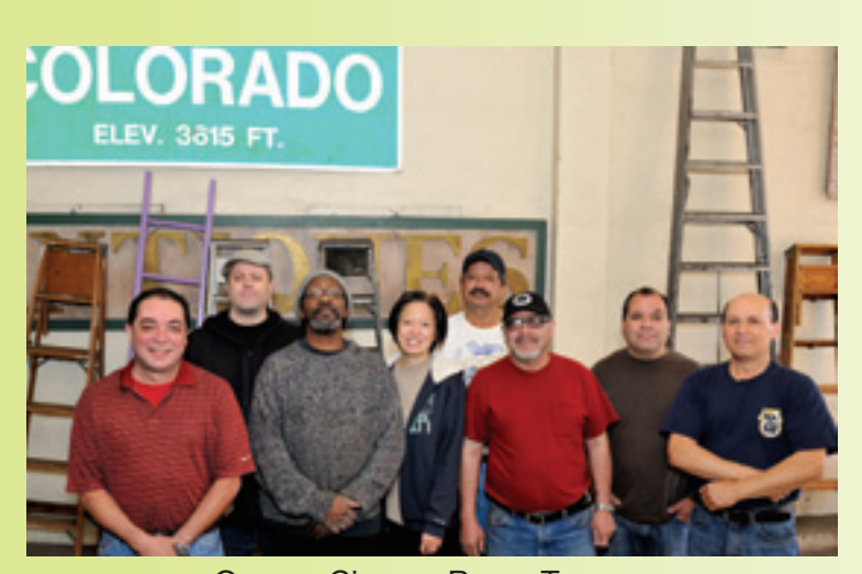
Omega Cinema Props Two