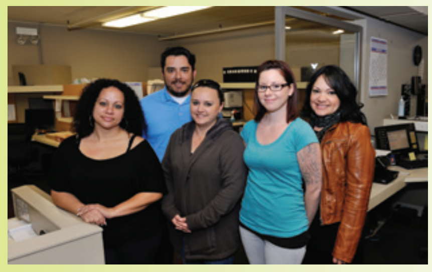
The Omega Cinema Props Office Staff