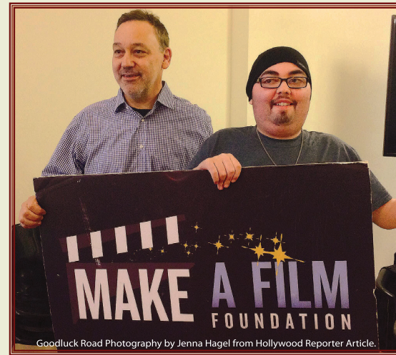
Goodluck Road