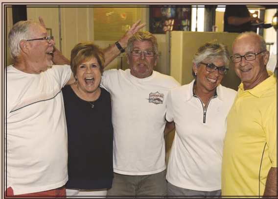
Retiree Reunion 2016

Teamsters Local 399 hosted a Retiree Reunion Dinner at Castaways in Burbank last November where we had over 100 Retirees in attendance. It was a wonderful time for Retirees to share stories, catch up on life, and enjoy each other's company.