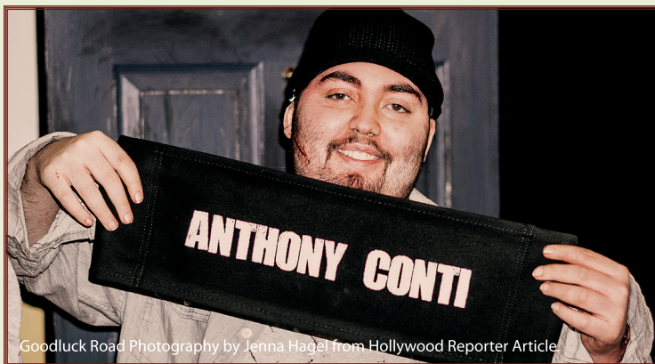
Goodluck Road