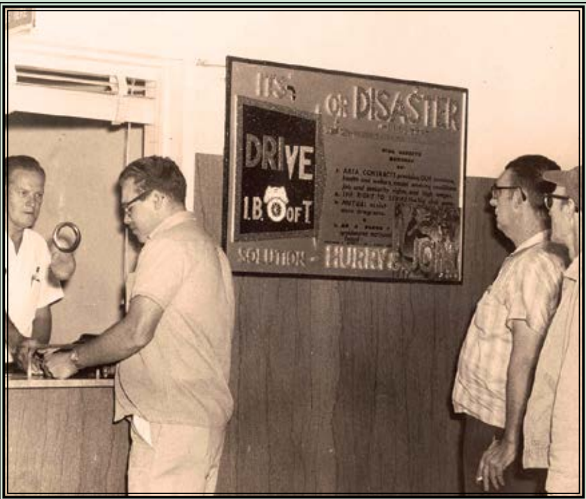
"It's D.R.I.V.E. Or Disaster" Old D.R.I.V.E Slogan.