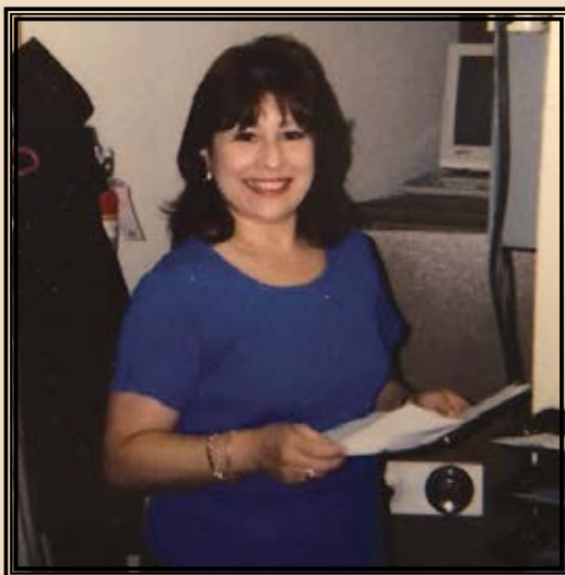
Around the office in 1998. This photo was taken before all the major renovation made to the Local 399 office.