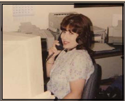
Behind the scenes in the Call Board in 1992.