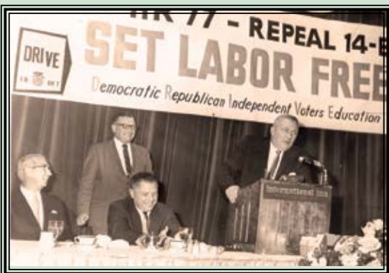
D.R.I.V.E. Executives speak on behalf of the impact of political action.