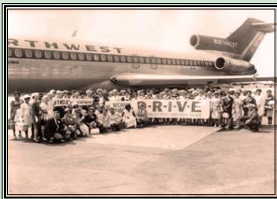
D.R.I.V.E. Motorcades arrive in D.C.