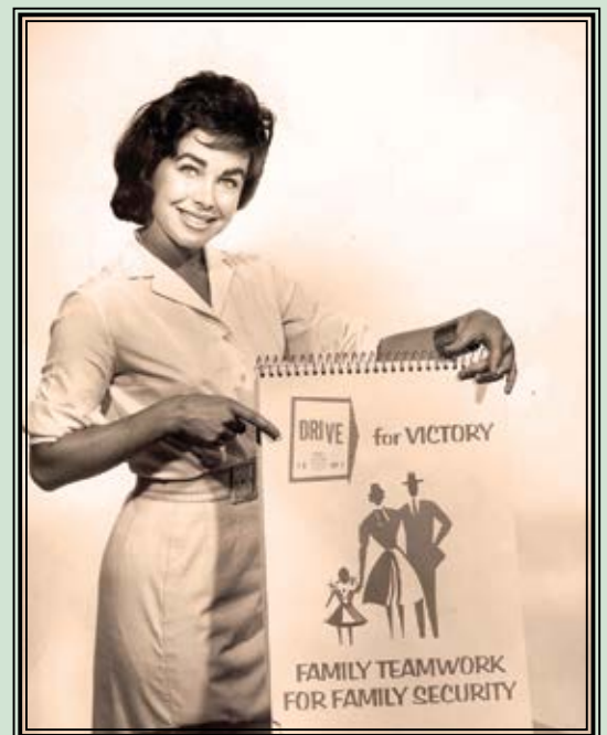
Promotional material for D.R.I.V.E.