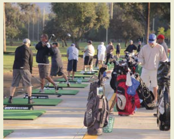
Members and golf tournament participants warming up.