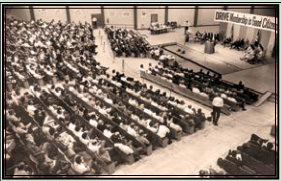
D.R.I.V.E. In Minneapolis.

T hrough grassroots political action and aggressive lobbying on Capitol Hill and in State Houses and City Halls across America, Teamsters have stopped some of the worst attacks on working people. But Big Business is pushing their agenda harder than ever. That means we have to fight back stronger than ever. We have to move forward with our own programs, like