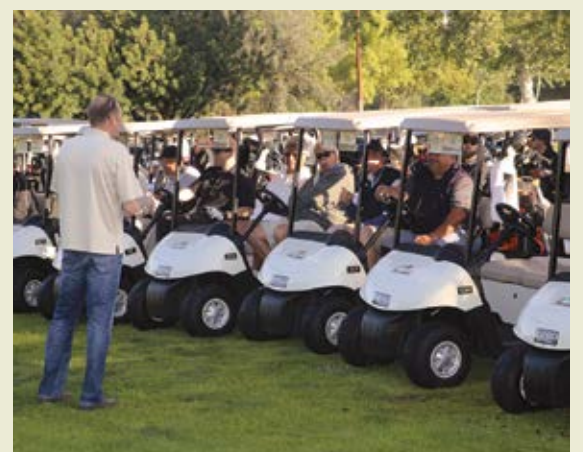
Secretary-Treasurer addressing the anxious participants before they begin.